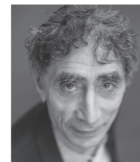
Gabor Maté M.D.